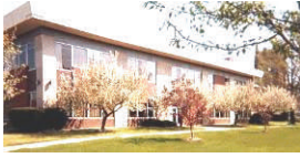
CLARA FRITZSCHE LIBRARY